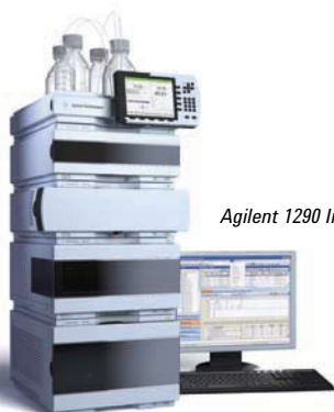
Agilent 1290 Infinity LC

Analyze more complex separations faster.