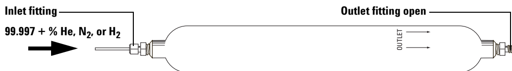
Figure 2 Outlet fitting open