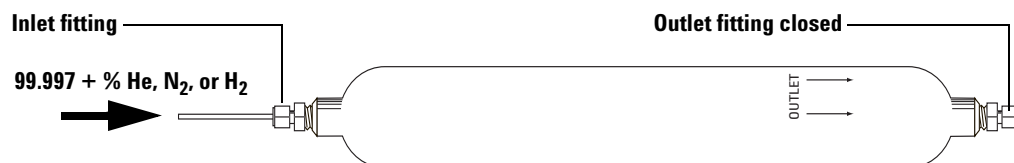
Figure 1 Outlet fitting closed