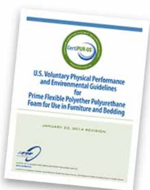
CertiPUR-US Technical Guidelines - download »

We have all of the requisite sampling and analytical equipment for flexible PU foam (FPF) analysis and characterisation for a variety of industries including the producers of foam stock, re-formed and molded foam and end user clients who use the foams in furniture, bedding and clothing products.